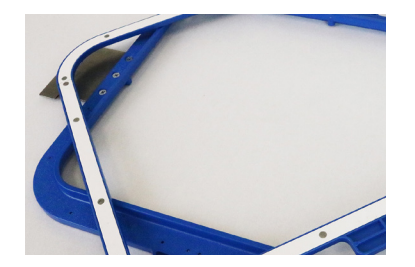
Mighty hoop With a wide variety of hoop sizes to choose from, these magnetic hoops make hooping all types of differently sized garments a breeze.

Designed for non-hoopable, difficult items such as shirt pockets, socks, backs of caps, shirt sleeves, collar tips and more.