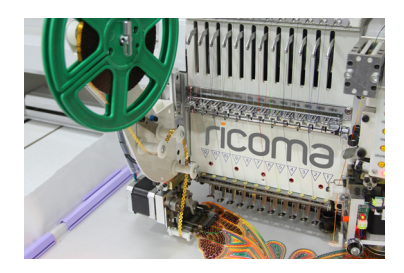
Sequin device Attach the optional sequin device to your embroidery machine for a pop of sparkle to your embroidery and a quick and easy fill.

These attachments make hooping and adding embroidery effects a breeze. Embellish your designs with sequins, boring or cording; or use specialty hoops for all embroidery needs.