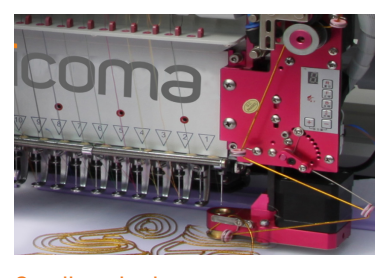
Cording device Easily create an embroidery effect with the cording device, which lays cord on fabric and attaches the cord with transparent zigzag stitches.